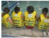
Boys and Girls Club

Projects Georgetown Swims (Boys and Girls Club, Exceptional Georgetown), Assistance Programs, World's Largest Swimming Lesson