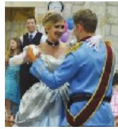
Royal Princess Ball

Projects Georgetown Swims (Boys and Girls Club, Exceptional Georgetown), Assistance Programs, World's Largest Swimming Lesson